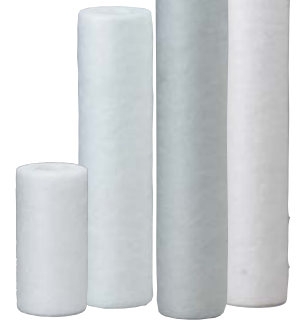
P5-478 P1 P1-20 P1-30 P5 P5-20 P5-30 P25 P25-20